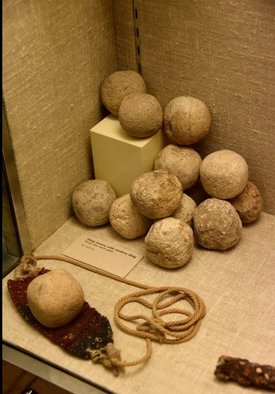
Sling stones, with modern sling from the same place No. 18000-40