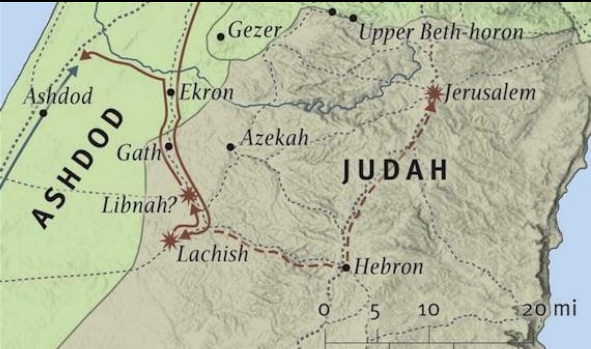
Sennacherib's campaign, from Crossway ESV Bible Atlas ( https://waynestiles.com/blog/lachish-blending-the-bible-history-archaeology )